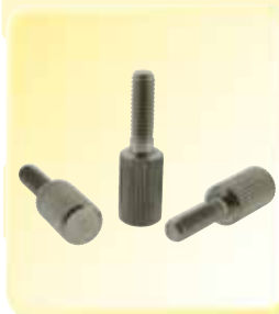
P1044 Thumb screws.