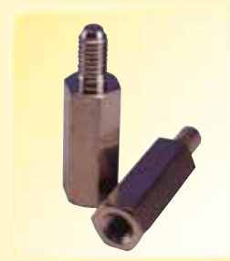
P1120 Threaded spacers, male - female.