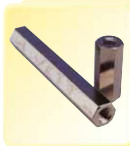
P1110 Threaded spacers-female.