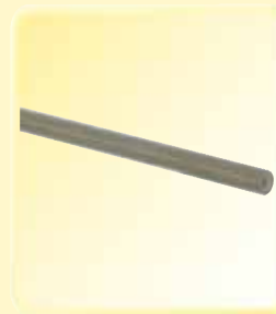
P1052 Stainless thread.