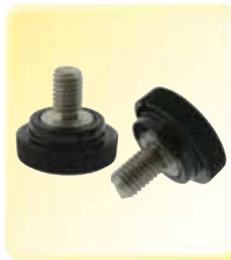
P1040 Thumb screws.