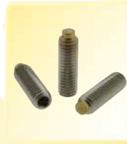
P1020 Brass tipped screws.