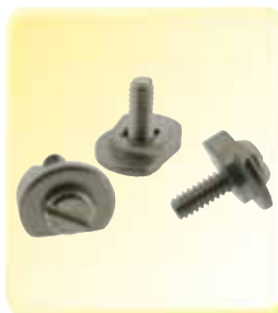
P1080 Cam cleats.