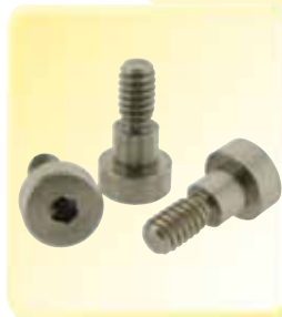
P1030 Shoulder screws.