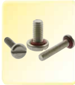
P1010 Integral seal screws.