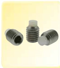
P1024 Nylon tipped screws.