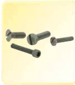
P1000 Machine screws.