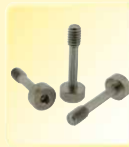
P1035 Captive screws.