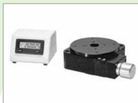
DRO Versions Any of the RT series with manual control with digital read out.