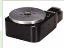
RM-5 Low cost. Ø125mm table. RM-5 Sealed unit option (L1168) Ø125mm table.