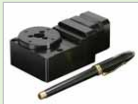
RT-2 Compact Design. Ø50mm table.