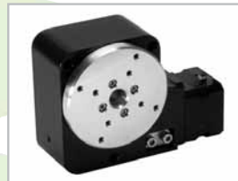
RM-3 Compact design. Ø75mm table.