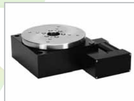
RM-8 High load capacity belt or direct drive. Ø200mm table.