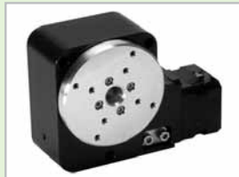
RT-3 Low cost. Ø75mm table.