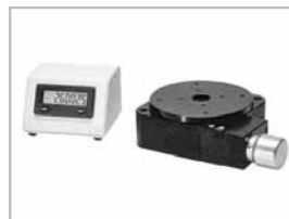
DRO Versions Any of the RM series with manual control with digital read out.