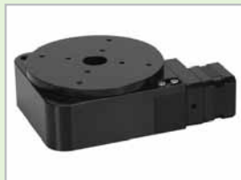
RT-5 Low profile. Ø125mm table.